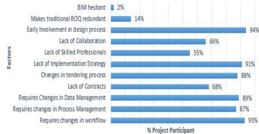
Figure 3. Challenges to a Green BIM approach in Australian AEC industry.

It was also revealed that despite the lack of contractual detail and client funding, interviewees agreed that commercial office projects are steadily moving towards higher levels of multi-disciplinary collaboration with mutual co-operation and increasingly incorporating BIM tools. In particular the younger AEC professionals (25-35) appeared to have a greater appreciation for integrated design processes and actively extended their responsibilities and scope (irrespective of contractual agreements) to achieve greater levels of design integration.