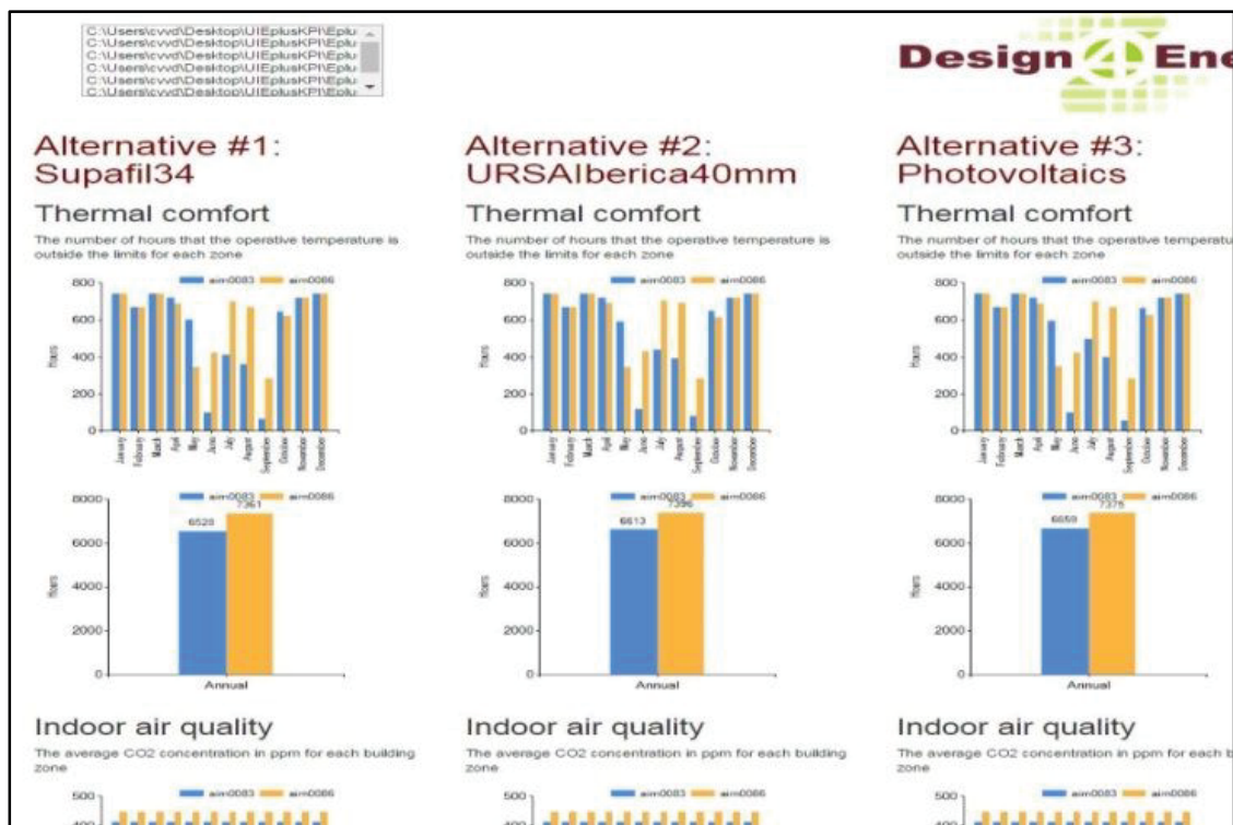
Figure 2: GUI for KPIs based on highest ranked retrofit alternative

Figure 2 is an extract from the prototype graphical user interface of the three alternatives as ranked by the tool. For each alternative the relevant KPI can be viewed using graphs that enable comparability across the different retrofit options. The GUI provides detailed results for each of the KPIs under consideration for users to critically assess the trade-offs between the different criteria for the selected retrofit options.