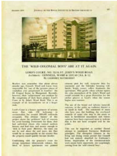
figure 6: a fake letter of objection to the building – Architectural Review 1930.

The virtual recreation and associated work allows us to address the specific questions ‘what might have been?’ and ‘what impacts would it have had?’ Had Connell’s work been better appreciated, perhaps he might have carried on to practice and design more buildings in Britain. This would have set a higher standard for high rise development, providing more alternatives to the weaker features of Modernism. As a result, this could have changed the public perception of high rise living making it more acceptable and popular. According to Heeley (1995) it would have been a powerful influence that might have set in train a move ‘away from the economic and social manipulation represented by the high-rise developments of the 1950s and 60s that are now discredited’.