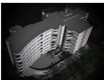
figure 3: the 3d model

A significant architectural practice, Connell, Ward and Lucas, active in Britain in the 1930s, is the focus for this illustrative investigation (Thistlewood and Heeley, 2000). Through the use of virtual recreation of what never existed a scenario can be created in which the question can be about whether the practice deserves a more prominent place in the History of Modern Movement in England can be explored. The effect of their potentially very potent influence on British and International architecture can be contemplated.