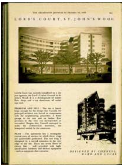
figure 5: a postulated review in an Architects Journal of 1929

The different digital representations can now be used to develop an imagined architectural lineage and associated critical debate. In figure 5 a report on the new Lords Court building in an issue of the Architects Journal in 1929 is faked. This gives the opportunity to review and comment on the building that might have been in a contemporary context. (figure 5)