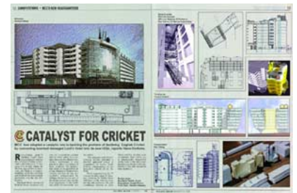
figure 8: the most recent reworking as a cricket academy in 1998