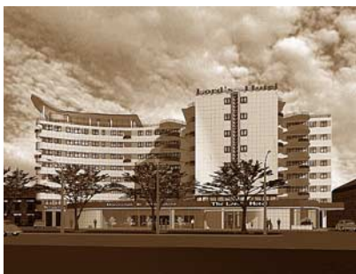
figure 4: a fake contemporary photograph.

In terms of computed representation the technique is very orthodox; AutoCAD and 3DStudio were used to generate the two and three-dimensional representations; see figures 3 and 1.