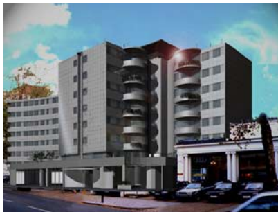
figure 1: a photomontage

The technique of digital photomontage has become well established in architecture. In this technique a view of a computer model of a building, saved in digital format, is merged with a digital photograph or scanned image of the intended site of the building. This method has found application in the case of new proposals for a site, or for the recreation of destroyed or unbuilt architectural projects; and it is clear that the nature of the digital representation in such cases fundamentally affects our perception (Mitchell, 1992; Brown and Nahab 1996). But the technique is a static one and based on two dimensional images, and over the past five years or so more computing capacity and better software has meant that we can contemplate the use of interactive three dimensional VR techniques to advance the systems for architectural design (Campbell, 1995): (figure 1).