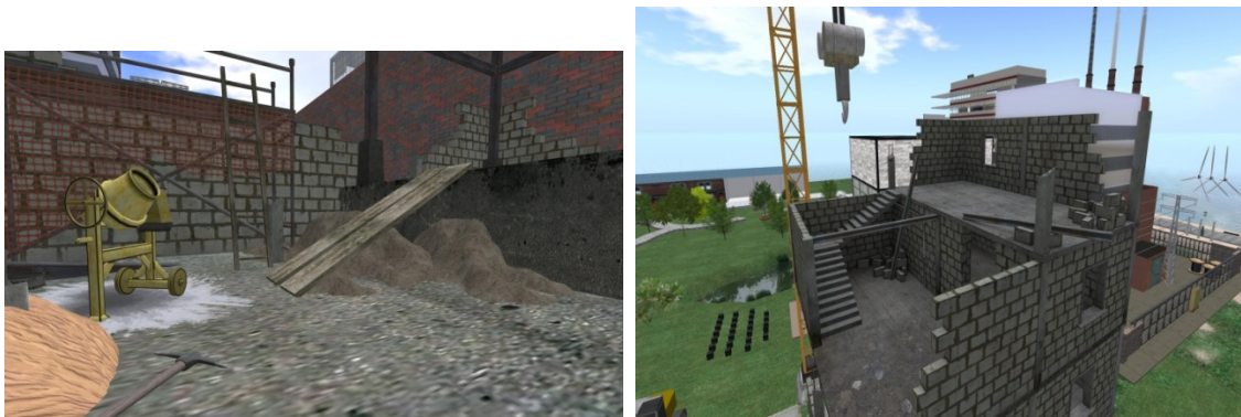
Fig. 2: Site safety explored in a virtual build

Lin et al. (2011) have considered how closely the game or environment has to emulate reality in order to create the desired immersive sensations and reactions, suggesting that high realism may not be cost effective in terms of developing effective educational games for some applications. To emulate reality and in particular the evolving construction site over time, Miller et al. (2012) have proposed to embed the concept of 4D planning (i.e. 3D virtual content changing over time) within the virtual world. Lin et al. (2011) suggested that reality can be emulated in a cost effective way by using traditional images and video footage within the game, but recognised that this may break the sense of presence and interrupt the learning activity. This limitation might be addressed through the use of an integrated Head-up Display (HUD) system within the virtual world platform of Second Life. For example, the developer of the Prohawk HUD has designed it to deliver an uninterrupted learning experience using scripted objects that provide feedback and guidance to learners. This allows participants to make choices, for example about the correct tools for excavation of particular layers of earth, and to learn from their choices (Romulus, 2011). Information about performance of participants throughout the task can also be gathered by the HUD system and reported back to trainers.