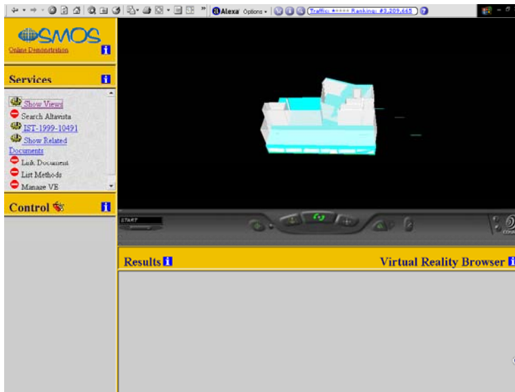
Fig. 2 The OSMOS Web Based Information Browser