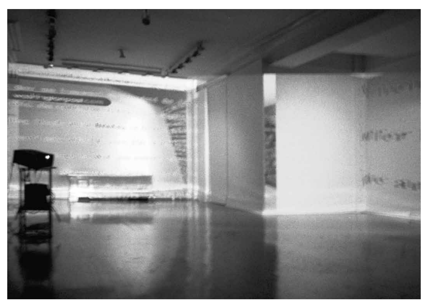
Figure 2. "Flux Space", installation, Arthur Ross Gallery, New York, 2000