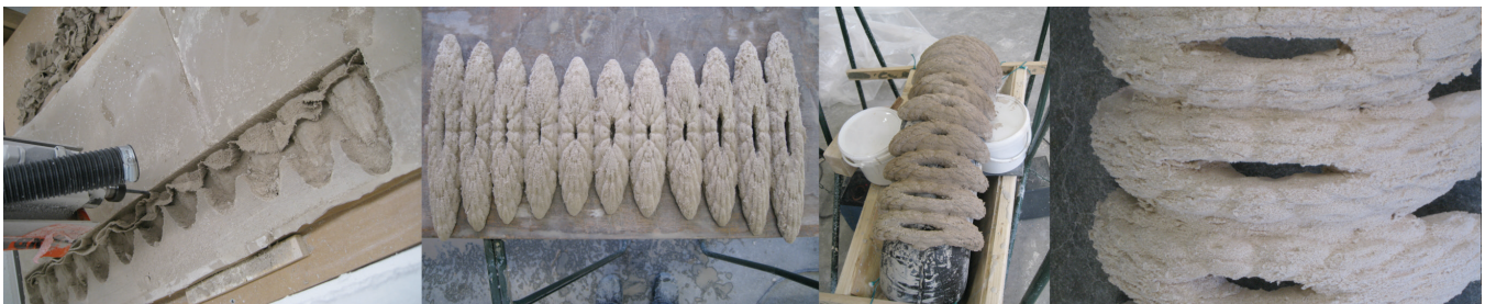
Figure 5: Machining hardened sponge, completed part soaked in clay slip, part placed over rounded primary form for drying, fired part showing excellent detail

The cut foam is then soaked with liquid clay, wrung to remove excess clay, and wrapped around or inside a primary plaster formwork for drying. The clay impregnated sponge, once dry, is then fired in its entirety, burning away the sponge and leaving only a lightweight, porous ceramic matrix. The resulting material is porcelain, stoneware, or earthenware foam which exhibits excellent fine secondary detail and perfect primary form (Figure 5). As an avenue for future research in architectural cladding materials, the eventual products would potentially exhibit high thermal and acoustic performance for buildings, and could also aid in the absorption of environmental pollutants.