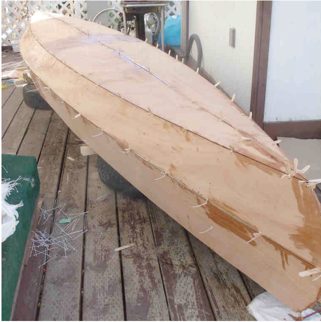
Figure 1: A stitch and glue canoe in production.

This “pre-form work” can possess a complex surface which serves to eliminate undercutting in a two-part mold, as well as to eliminate the various traditional key-making techniques necessary for refitting form work together; the form is sufficiently complex to serve as a “keyless” fitted mold when assembled for casting (Figure 1).