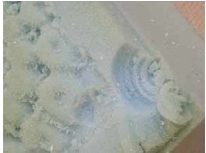
Figure 4: Spalling in an unprepared sponge

The research accounts for this behavior by stiffening the material using combinations of rice or potato starch, cellulose gum, or even dried clay. Stiffened foam cuts quickly and precisely, thus reducing machine time. Since the foams in question contain roughly ninety percent air, shop dust and material waste are also greatly reduced.