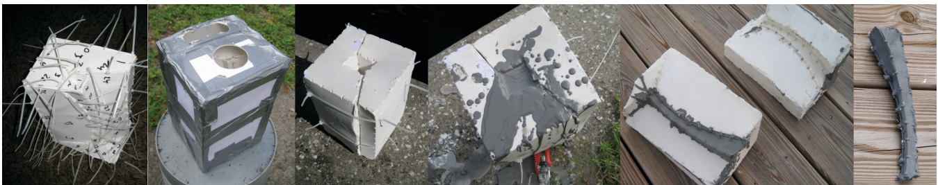
Figure 2: Left to Right; Stitching the pre-form, preform ready for plaster pour, assembled plaster mold, liquid clay fills the mold, mold is opened as the clay becomes leather hard, completed ceramic object ready for firing.