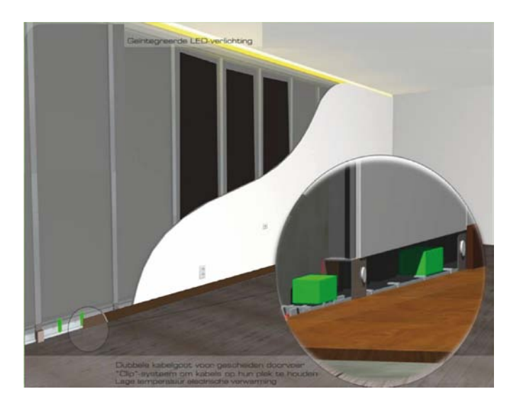
Figure 2: 3D- anisotropic section of the developed DCA-Wall

However, this case study has shown that domotics applications are in an efficient and affordable way, feasible in the existing housing stock and the addition of functions to a product in this way is positively translated in the added value of the product. The applied technology can keep tele-care within reach, without having a typifying or stigmatizing effect on the occupants. This perspective can lead to completely new concepts for a living environment through which the current gap between demand and supply in the residential care provision can be bridged.