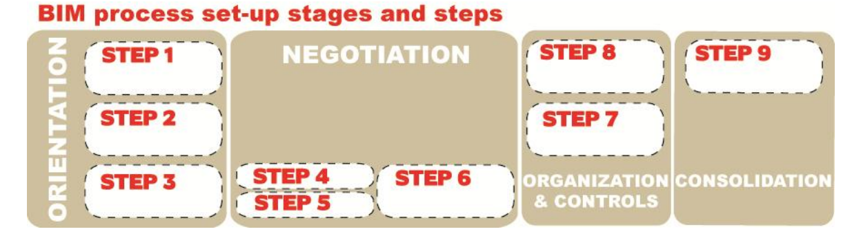
Figure 1-1 BIM process setup steps

The added value of a BIM-based delivery and operation process is spread throughout all its phases and can, therefore bring benefits to all actors involved in each stage. A particular aspect of the added value a BIM product can bring to the project is enabling optimized activities of analyzing, testing and validating the design before the project execution, thus saving a significant share of failure costs later in the building lifecycle [Eastman e.a., 2008], [Kiker, 2009].